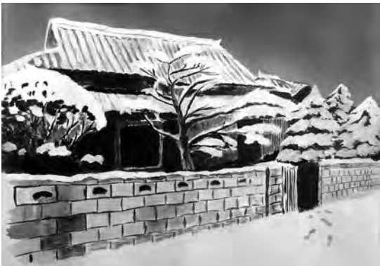
Peering through the camera's viewfinder, I began to take photos. I captured frosted bonsai trees outside homes.