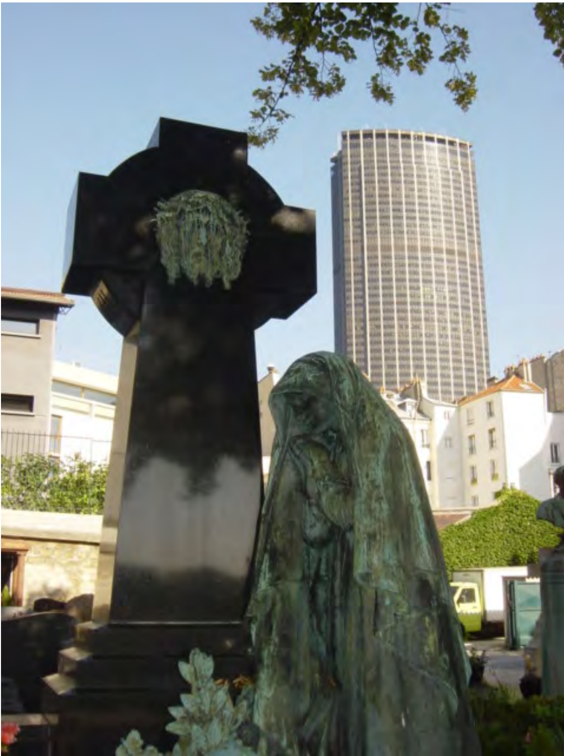
The much-derided Tour Montparnasse fits very well with scenes from the cemetery.