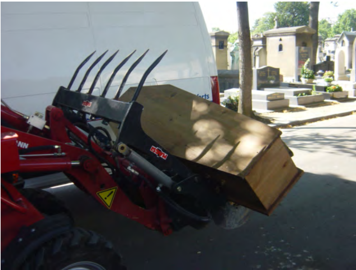
An empty coffin heading towards its last resting place

have befitted an Absurdist. However, the inscription makes up for it: "Pray to the I-don't-know-who: Jesus Christ I hope."