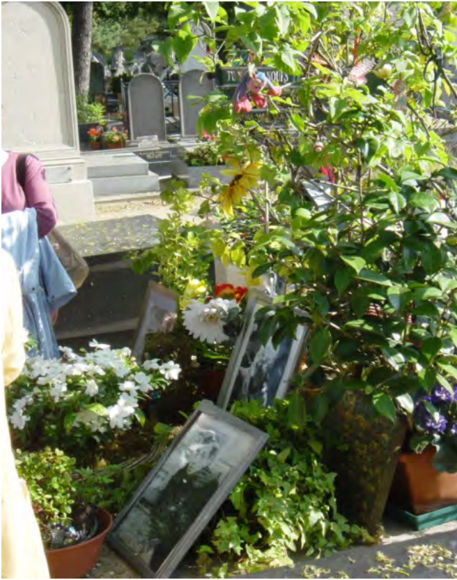
Serge Gainsbourg's tomb covered in gifts from fans.

Montparnasse cemetery has a windmill dating from the 17th century when the land was for farming owned by a hospital and a religious order. There were stone quarries nearby so building the windmill was easy. Pity about the lack of sails, though. Later the hospital used the land as a burial ground for unclaimed bodies. In 1824 the City of Paris formalised the land as a cemetery for Left Bank residents. Now it is still a decidedly "living" graveyard with around 1000 burials every year.