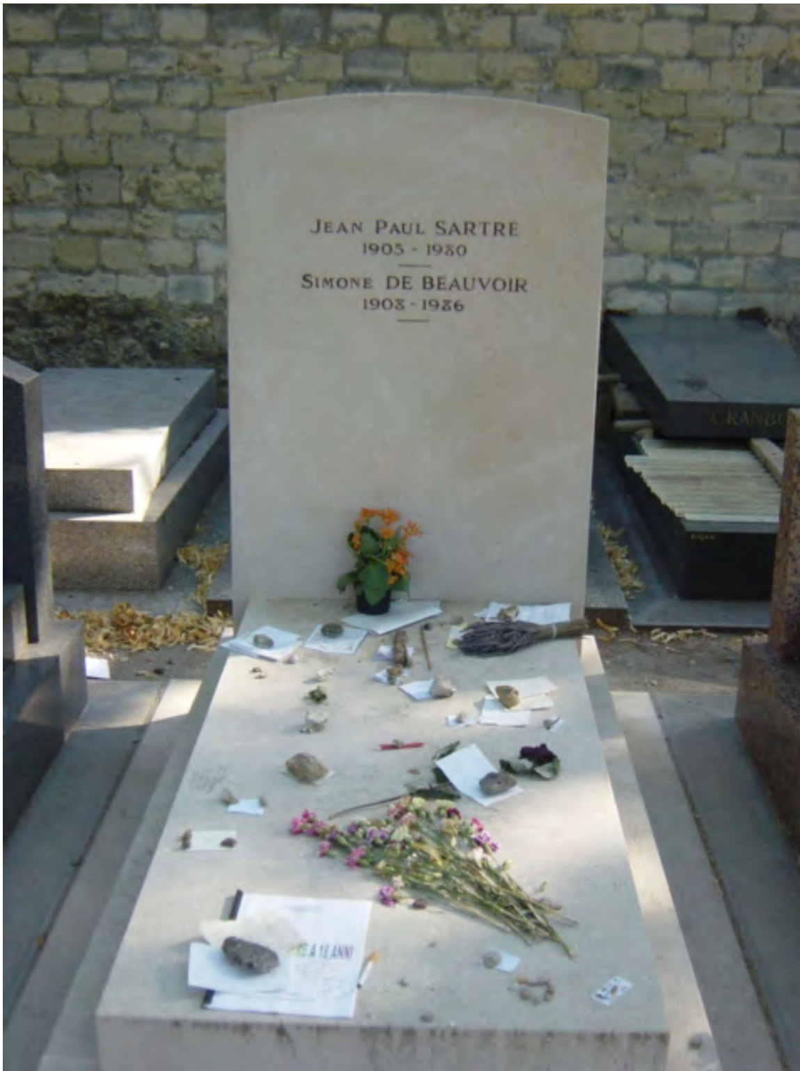
Jean-Paul Sartre, Simone de Beauvoir - a stone adorned with simple mementos.

The following are my notes at the time of finding the large monument to a French explorer: